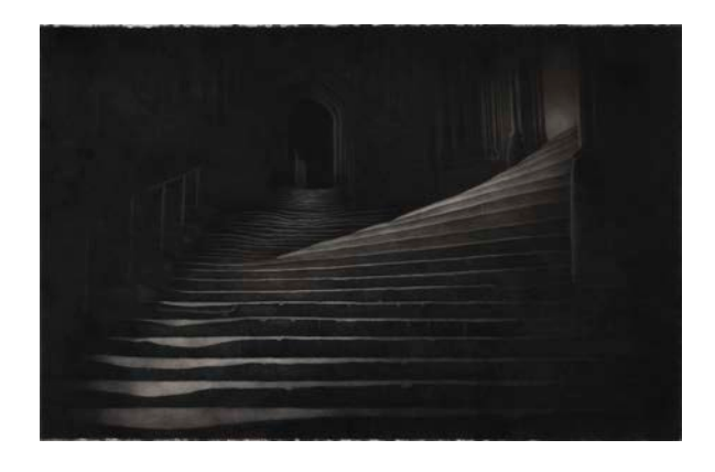
[Caption] Yuriko Terazaki Wells Cathedral Staircase 2020 black color pencil on paper 67 x 103 cm (sheet)

[Credit Line] © Yuriko Terazaki / Courtesy of Gallery Koyanagi