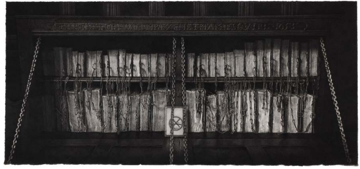
Yuriko Terazaki, Chetham's Library #1, 2024