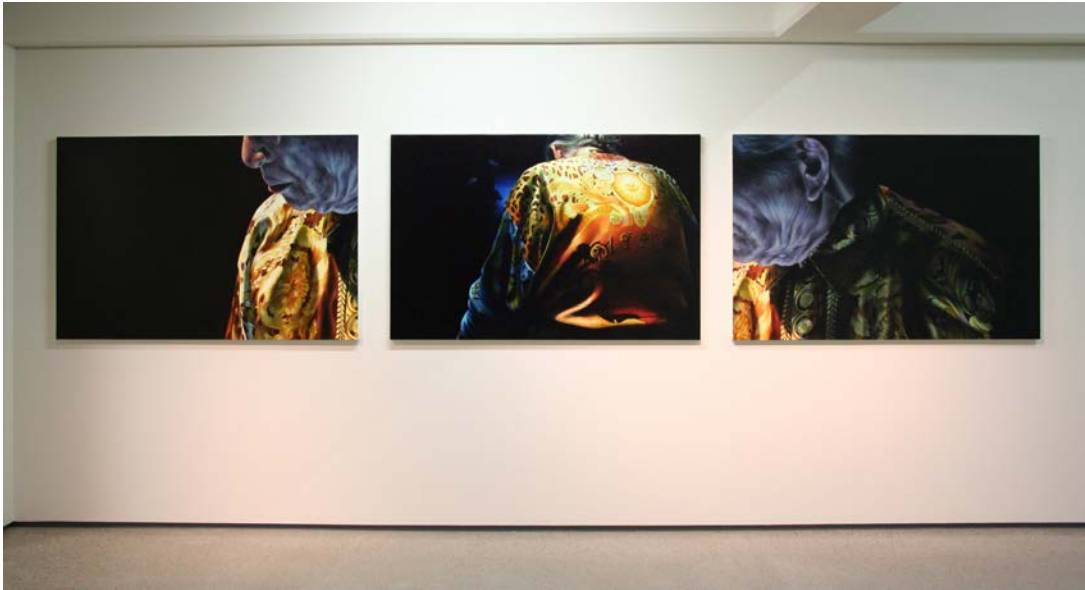
Installation view of "Portrait" at Gallery Koyanagi, 2017