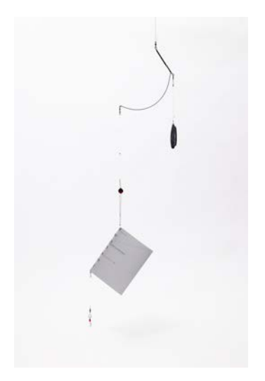
[Caption] HeiQuicci HARATA: Poem-Broidery in PixEL-DORADO YOUME no OUQUI-HASCI, The Floating Bridge of Dreams. (2010) Book mobile with OUQUI, floats